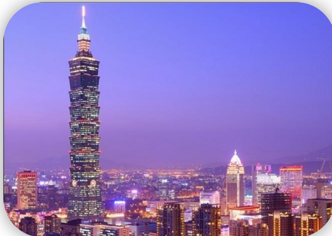
Taipei 101, the second tallest building in the world.

view the beautiful scenery surrounding the lake. The tour included a visit to the city Kaohsiung where the group took a walk along Love River and the exciting Lio Ho Night Market. The night market was great, and gave everyone the opportunity to try traditional Taiwanese food like Blood Cakes and Stinky Tofu (smelled bad, but overall tasted good). The group visited popular stops along Taiwan's scenic east coast such as Little Yeliu, Stone Steps, and Sanxiantia. On the last day of the tour the group visited Taroko Gorge. The tour guide brought the group to two suspension bridges that