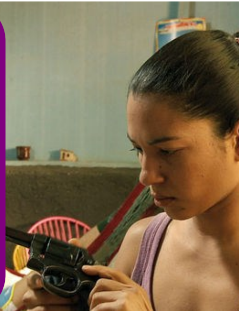
El Alamein - The Line of Fire , on the left, and La Yuma , two of the movies shown this semester.

WITH ENGLISH SUBTITLES (MORE INFO. IN PAGE 3)